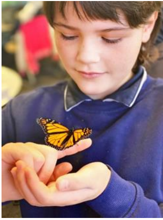
Crystall – I enjoyed discovering information about how to determine the gender of a butterfly.