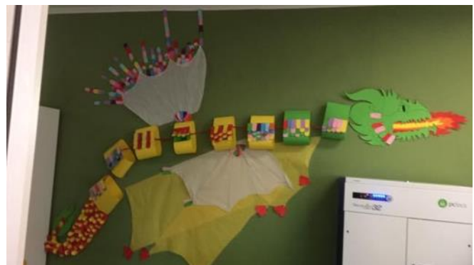
What Went Well #2: Danzi is our class hallway art project for Term 2. Danzi is the dragon from our class novel, “Dragonkeeper” by Carole Wilkinson. Our Chromebook locker is to the right.