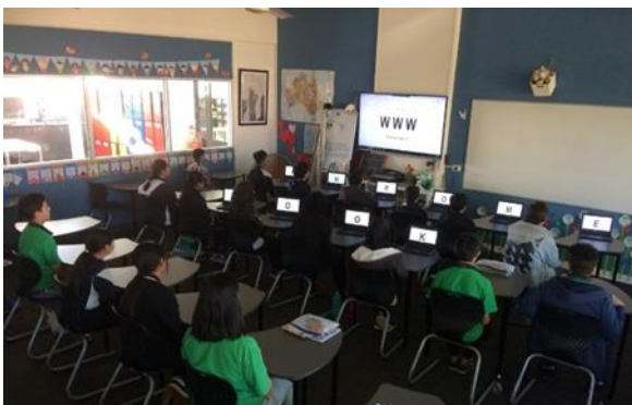
What Went Well #1: Our Chromebooks make it so much easier to learn! We can research, share work and help each other, as well as sit tests and submit our finished work. We love them!