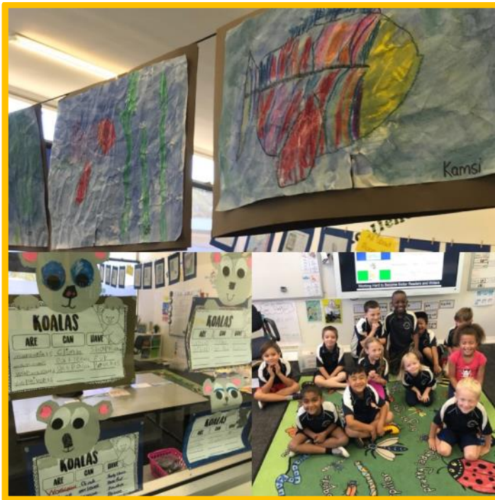
In Room 11 we have been busy learning about Australian Animals, habitats and lots more!