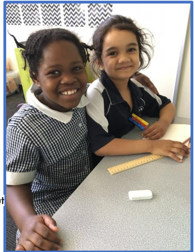
In Room 8 we have been developing our fluency in maths.