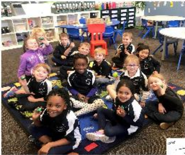
Room 17 have been using different instruments like egg shakers to learn about the beat and rhythm in music.