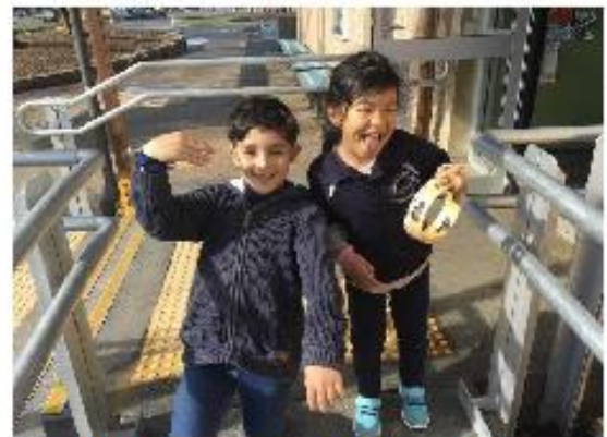
In Room 15 we have been enjoying learning about the basics of music such as the beat, rhythm and pitch.