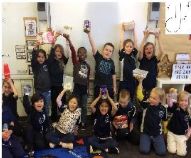
Rooms 9 and 10 had a challenge: To predict which materials we could use to make the loudest shaker; rice, sand, coffee beans, pasta, marbles or rocks. We made our shakers and then tested our predictions.