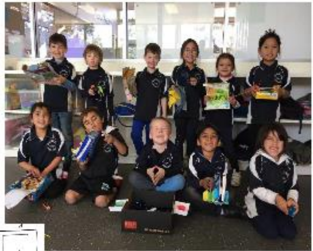
In Room 16, we have been learning to sing songs to guitar and designed our own guitars.